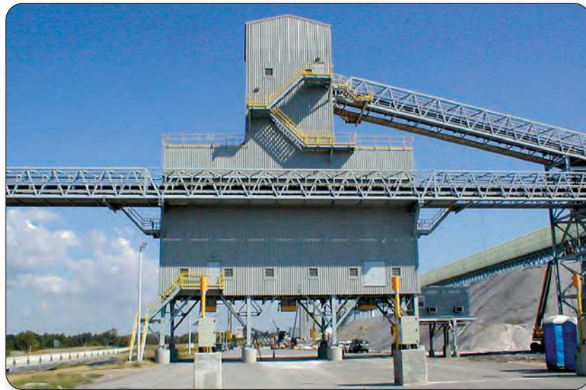
Triple bay truck loadout system