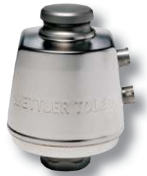
POWERCELL PDX Load Cell

Upgrade your scale to POWERCELL® PDX® technology and experience the ultimate in reliability. POWERCELL PDX load cells eliminate the need for maintenance-prone junction boxes, totalizers, and sectional controllers.