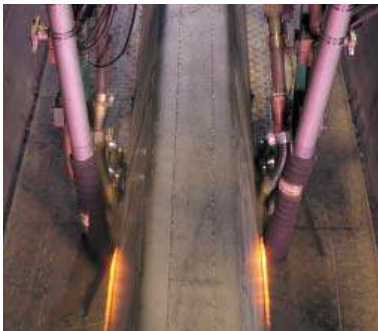
Modules are robotically welded to meet the highest quality standards.

The result is the same high quality for every scale, every time.