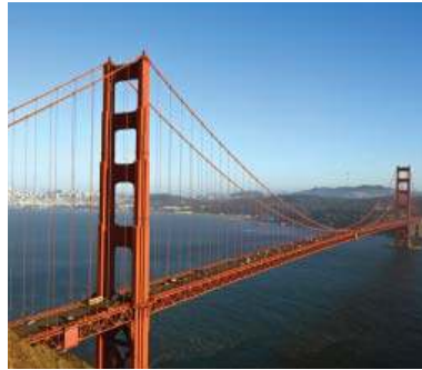
Our scales have the same orthotropic design used for the Golden Gate Bridge and many other high-traffic roadway bridges.

When a highway bridge fails, the results can be catastrophic. Many bridge designers are now turning to orthotropic ribs as a better alternative to conventional I-beam structures because of the proven strength, reliability, and longevity. They know that the strength and durability of a weighbridge has more to do with how the steel is used than with how much steel is used. Don't let a failed weighbridge be catastrophic for your business.