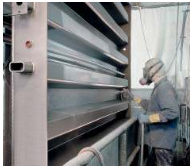
Metal surfaces are coated with a two-part epoxy finish to protect against corrosion.

The end result is a durable finish that protects against the corrosion and contaminants that can shorten the life of a scale.