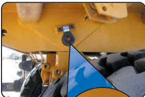
Rear Load Pin and Beam Load Cells enable on-board weighing.

KSS on-board weighing technology gives you the ability to mix commodities going into the charge bucket while in the scrap yard. Wireless communication with the loader shows how much of each "ingredient" is going into the bucket or onto the truck. The information is then stored in a database where it can be referenced for future batches or mixes. Our system of wireless technology and communication allows for increased accuracy and efficiency in the yard.