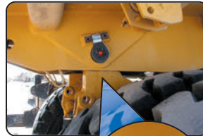
Rear Load Pin and Beam Load Cells enable on-board weighing.

KSS on-board weighing technology gives you the ability to mix commodities going into the charge bucket while in the scrap yard. Wireless communication with the loader shows how much of each “ingredient” is going into the bucket or onto the truck. The information is then stored in a database where it can be referenced for future batches or mixes. Our system of wireless technology and communication allows for increased accuracy and efficiency in the yard.