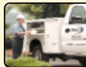
National Service & Repairs On-Site, 24/7 Technical Support is One Phone Call Away.

One call, one number, anywhere in the world... it's just that easy!