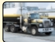
Heavy Capacity Testing & Calibration Turnkey Solutions for Rail & Truck Scale Applications.

We offer repair and maintenance service 24 hours a day, 7 days a week. Technical phone support is available any time you need us - nights, weekends, holidays. For national service contracts, you call one number for any emergency or repair service you need anywhere in the world.