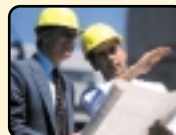
Project Consultation Experienced Engineers Providing Custom Solutions.