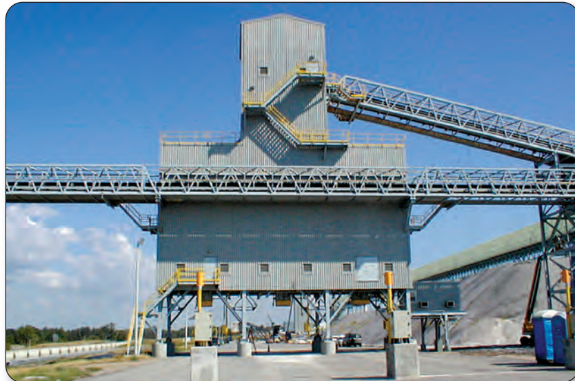
Triple bay truck loadout system

Building Relationships. Creating Solutions.